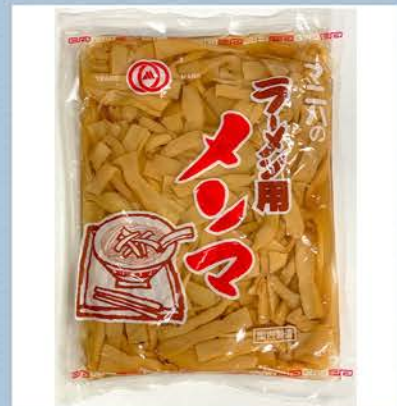
Maniha Ramen Menma Bamboo Shoots 11250 2.2 lbs x 15 packs