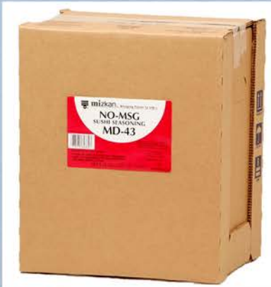
Mizkan Sushi Vinegar MD-43 Red 10148 5 gal