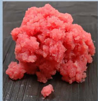
Tetsujin Ground Tuna F20301N 1 lb x 11 packs