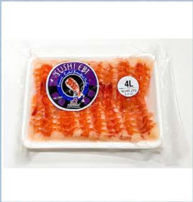
Pafco Sushi Ebi 4L F20413 30 pcs x 20 trays