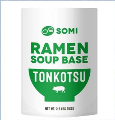
Somi Tonkotsu Pork Soup Base 06376N 1 lt x 10 packs