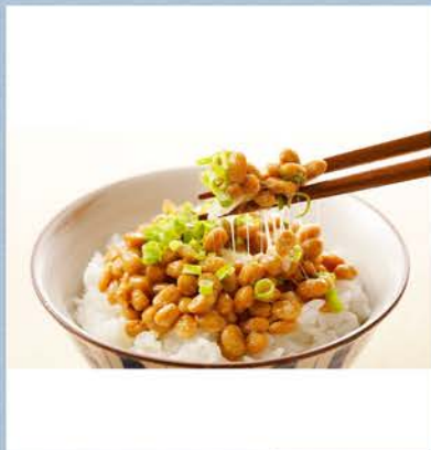
Hokkaido Natto F20620 4.2 oz x 12 packs