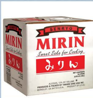
Takara Senryo Mirin 14272 18Lt Cube