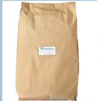
Miyako Crispy Tempurako KP-3 02163 40 lbs