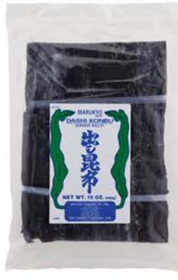
Marukyo Dashi Kombu For Soup Base 09401 1 lb