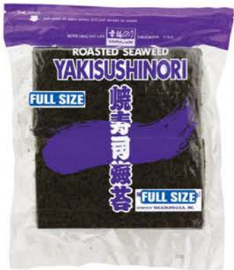
Takaokaya Nori Full Sheet Purple 09315 50 sheets x 10 packs