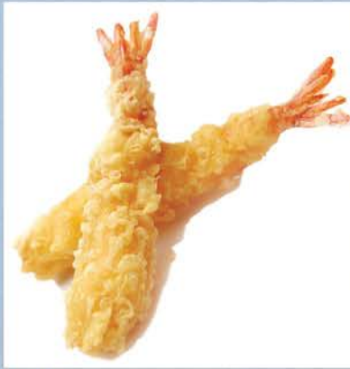
DNI Tempura Shrimp 21/25 F20446 135 pcs