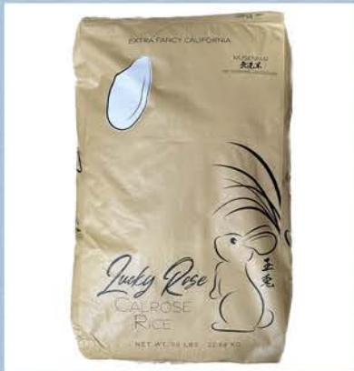
Lucky Rose Cal Rose Rice Poly Bag 01202 50 lbs