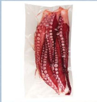
Kohyo Tako Ashi 5-6 Madako F20130 22 lbs