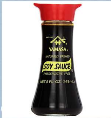
Yamasa Regular Soy Sauce Dispenser 5 oz x 12 bottles