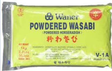
Kinjirushi Waner Wasabi V-1A Powder 08247 2.2 lbs x 10 packs