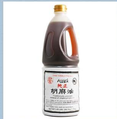
Kuki Junsei Sesame Oil 58 oz x 6 bottles