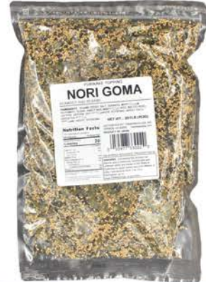
Takaokaya Nori Goma Furikake Bulk 07326 1 lb x 20 packs