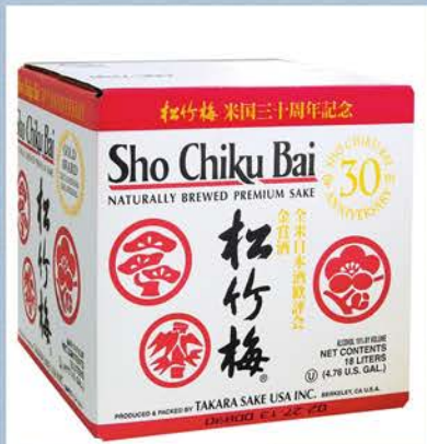
Sho Chiku Bai Signature Sake Premium Hot Sake 14161N 18Lt Cube