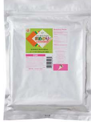
J Oil Mamenorisan Pink Soy Crepe 09082 20 sheets x 10 packs

WARNING: Consuming this product can expose you to chemicals including lead, cadmium, arsenic and acrylamide which are known to the State of California to cause cancer and birth defects or other reproductive harm. For more information go to www.P65Warnings.ca.gov/food .