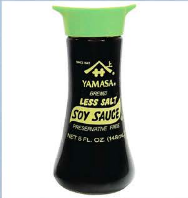
Yamasa Lite Soy Sauce Dispenser 5 oz x 12 bottles