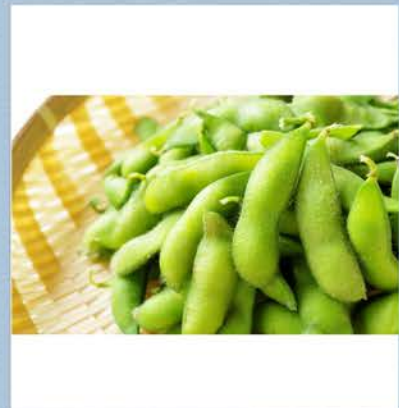
NAF Edamame F20693N 2.2lb x 10 packs