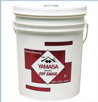
Yamasa Regular Soy Sauce Tub 5 gal