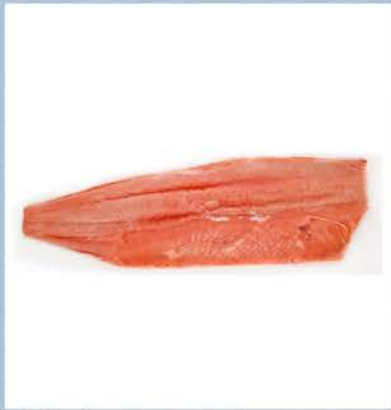
Tokai Atlantic Smoked Salmon 4-5 lbs F20221N 7 pieces