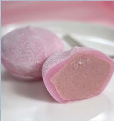
Imuraya Mochi Ice Cream Strawberry