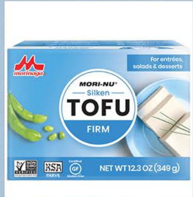
Morinu Silken Blue Firm Tofu 11462 12 oz x 12 packs