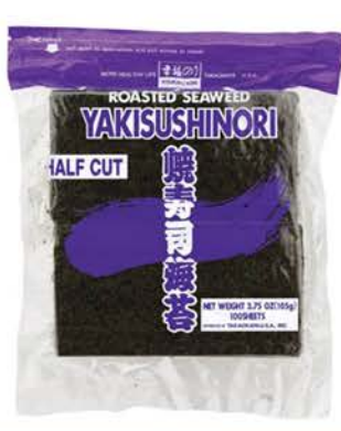
Takaokaya Nori 1/2 Cut Purple 09316 100 sheets x 10 packs