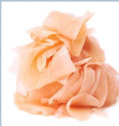
Bulk Gari Shoga Amasuzuke No Color 10676N 20 lbs