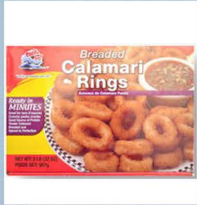
Pafco Calamari Rings Breaded