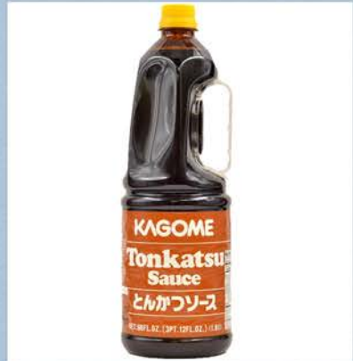
Kagome Tonkatsu Sauce Bottle 60 oz x 6 bottles