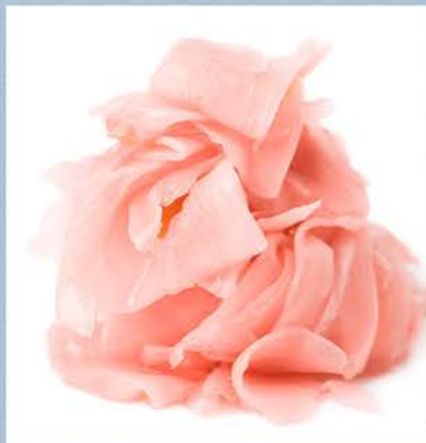
Bulk Gari Shoga Amasuzuke Pink 10674N 20 lbs