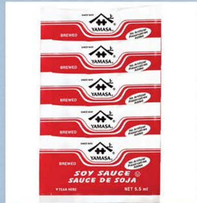
Yamasa Zesty Soy Sauce Takeout Shoyu 500 packets