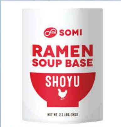
Somi Shoyu Ramen Soup Soy Sauce Base 06377N 1 lt x 10 packs