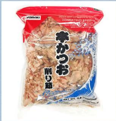
Yamaki Hon Katsuo D 09236 1 lb x 6 packs