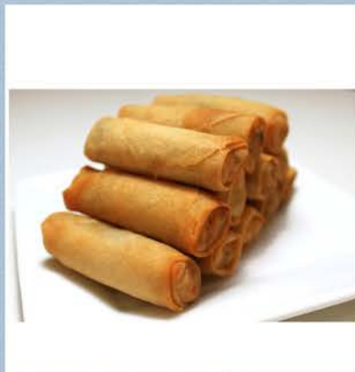
Ming Hong Veg Sprin gRolls