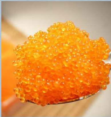
Azuma Foods Masago F20309N 2 lbs x 12 trays