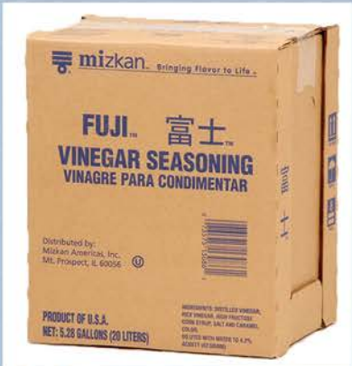
Mizkan Fuji Su Vinegar 10140 5.28 gal