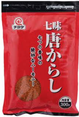
Chiyoda Shichimi Togarashi Seven Spices 08122 10.5 oz x 40 packs