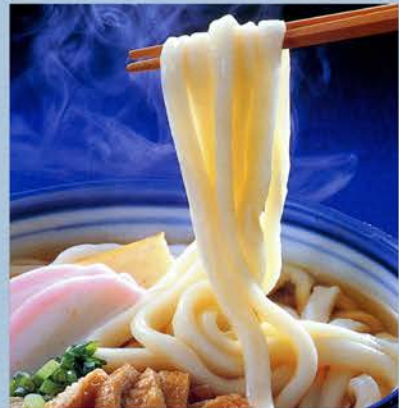
Kanoya Teuchi Udon