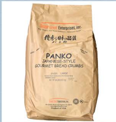
U.S. Panko Bulk 02211 20 lbs