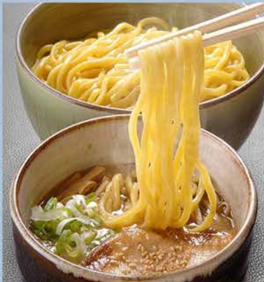
Circle A Ramen Wavy #22W