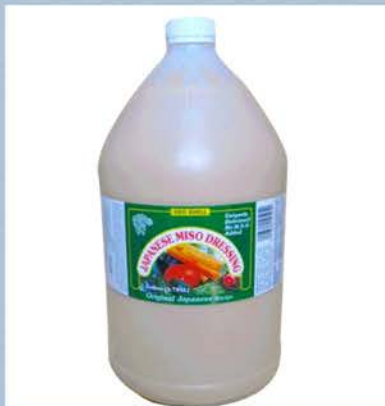
Red Shell Miso Dressing Gallon Size 1 gal x 4 jars