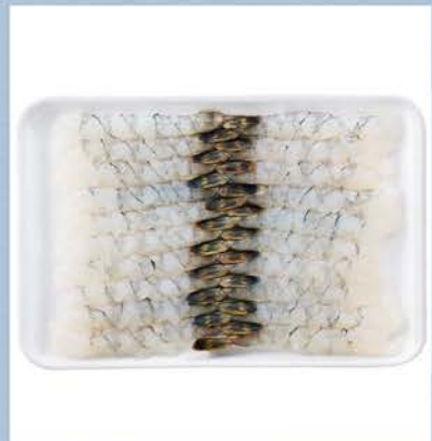
Elite Nobashi Ebi 26/30 F20401 25 pcs x 30 trays