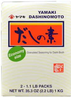
Yamaki Karyu Dashinomoto Dashi Powder 07022 2.2 lbs x 10 boxes