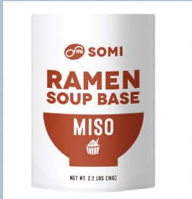
Somi Miso Soup Miso Base 06379N 2.2 lbs x 10 packs