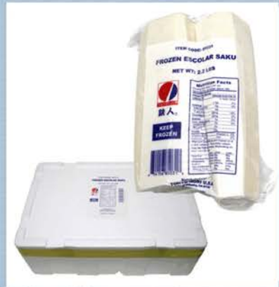
Ming Hong Escolar Saku F20125 22 lbs