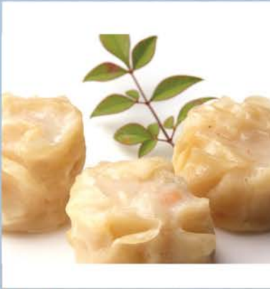
DNI Yokohama Shumai