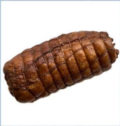
DL Chashu Bulk 9pcs