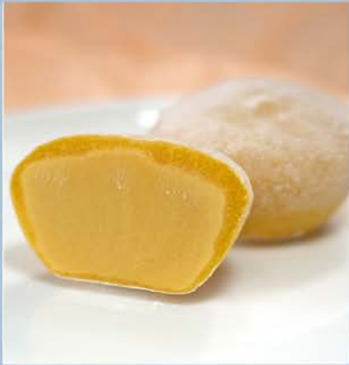
Imuraya Mochi Ice Cream Mango