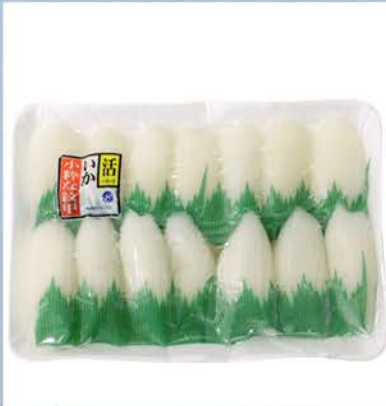
Pafco Cuttlefish M 16-20 pc F20161 12 packs