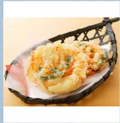
Azuma Foods Yasai Kakiage Bulk