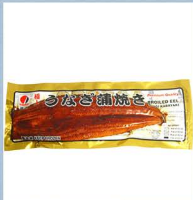
Ming Hong Unagi Roasted Eel 11oz F20171N 22 lbs