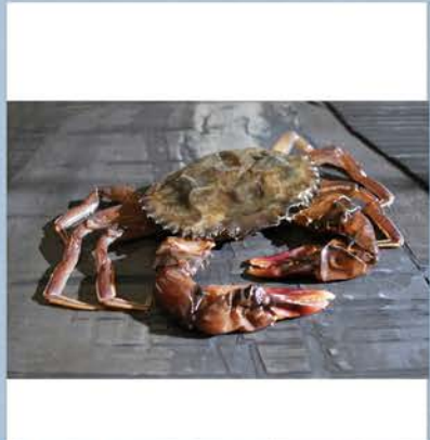
Maneki Soft Shell Crab Hotel F20226 18 pieces x 6 boxes