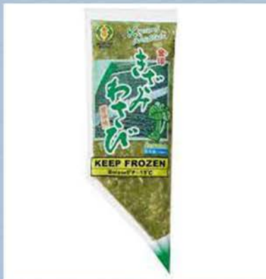
Kinjirushi Kizami Wasabi YKD-100 Tubes F20626 3.5 oz x 10 tubes