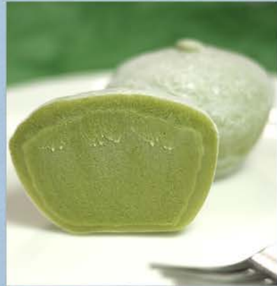
Imuraya Mochi Ice Cream Matcha