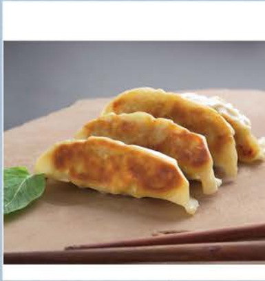
O'Tasty Gyoza Pork & Veg