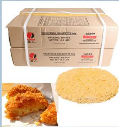
Ming Hong Vegetable Croquette