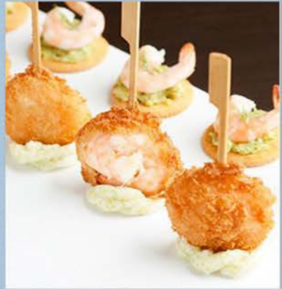
Azuma Foods Shrimp Swirl Pops