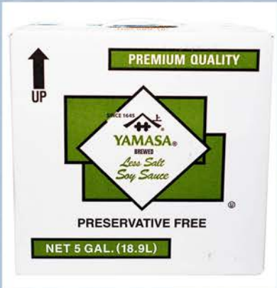
Yamasa Lite Soy Sauce Less Salt Tub 5 gal