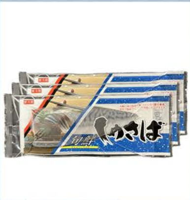
Saba Shime F20116 20 x 125g

WARNING: Consuming this product can expose you to chemicals including lead and acrylamide which are known to the State of California to cause cancer and birth defects or other reproductive harm. For more information go to www.P65Warnings.ca.gov/food .