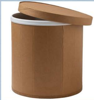
Gunther's Ice Cream Green Tea