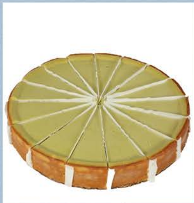
R&D Wing Green Tea Cheesecake