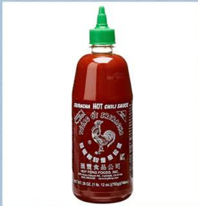
Huy Fong Cock Sriracha Chili Sauce