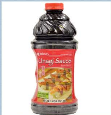
Mizkan Unagi Sauce Bottle 64 oz x 6 bottles