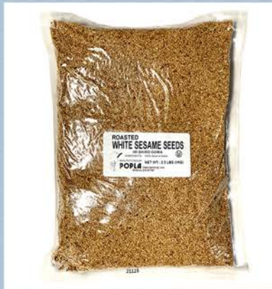
Miyako Iri Shiro Goma Domes 09612 2.2 lbs x 12 bags