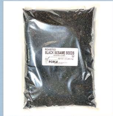
Miyako Iri Kuro Goma Domes 09613 2.2 lbs x 12 bags