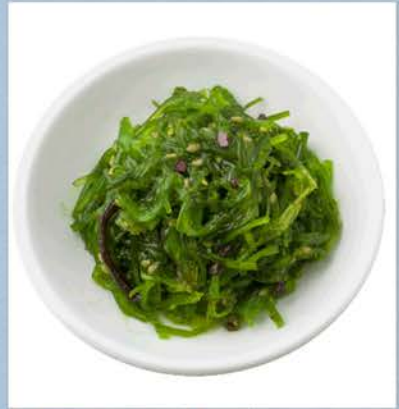
Azuma Foods Goma Wakame Seaweed Salad F20500 4.4 lbs x 4 tubs