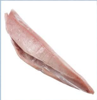
Ming Hong Tetsujin Albacore F20132 22 lbs