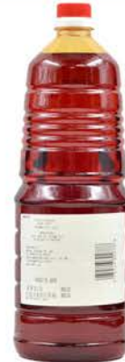
Chiyoda Rayu Oil Layu 08139 2 lt x 6 bottles