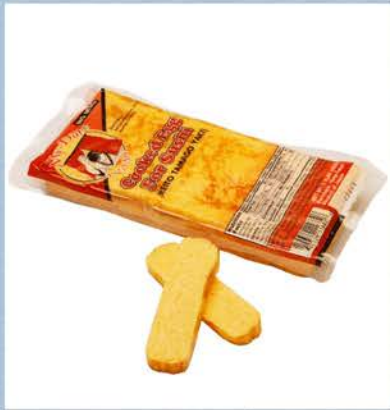
Sushi Egg Tamago Yaki Semi Sweet