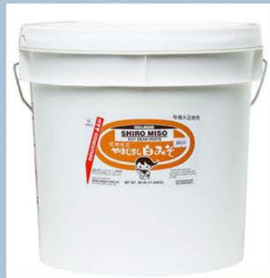
Yamajirushi Shiro Miso Tub 05209 38 lbs